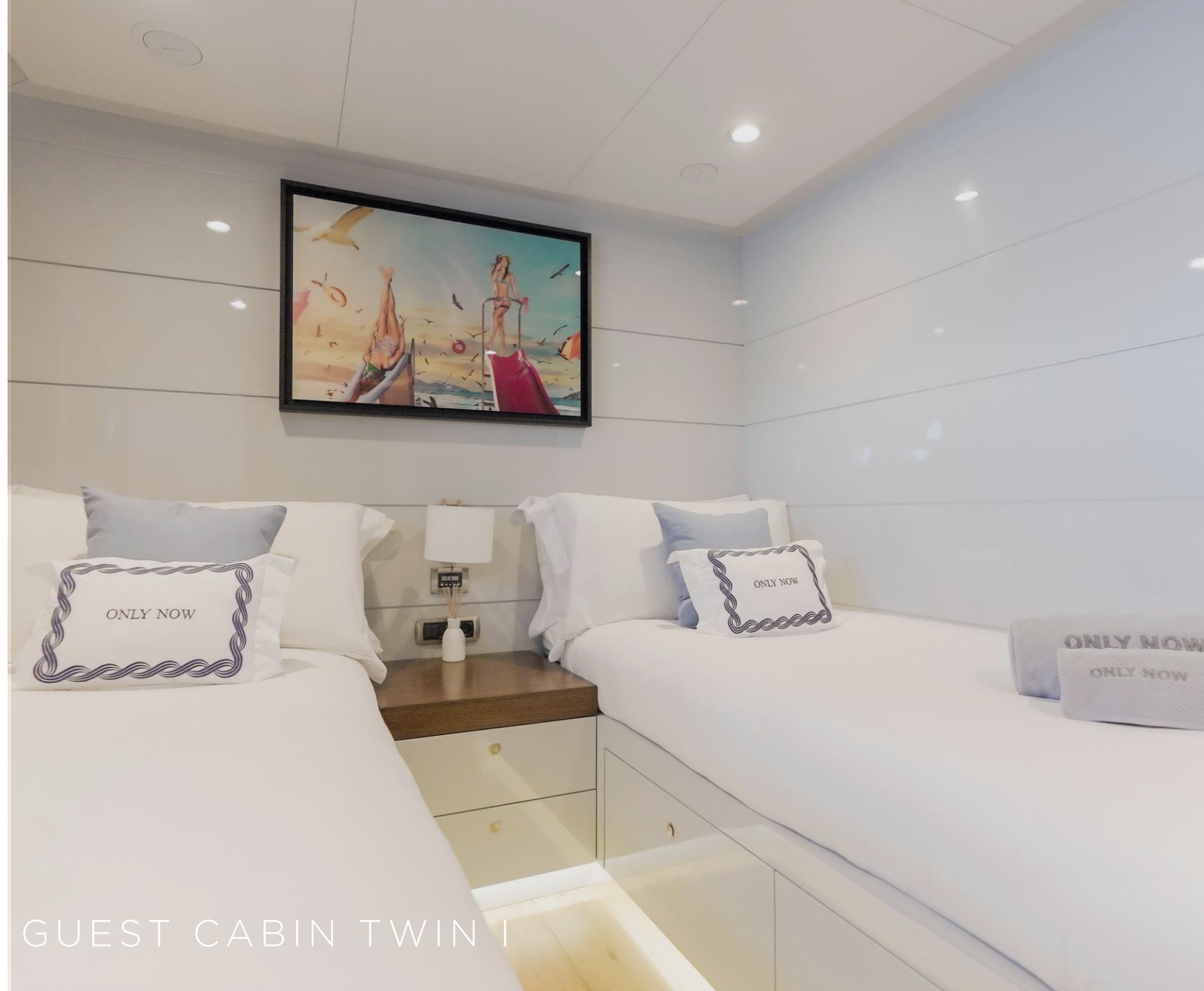
GUEST CABIN TWIN I