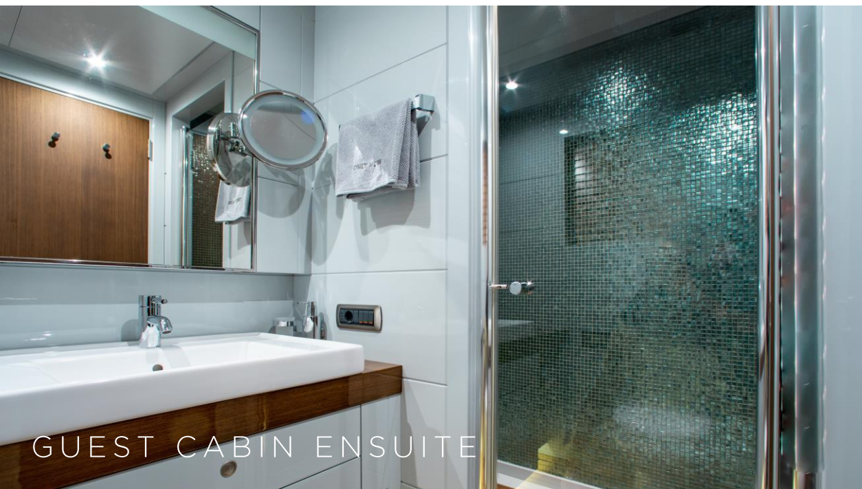
GUEST CABIN ENSUITE