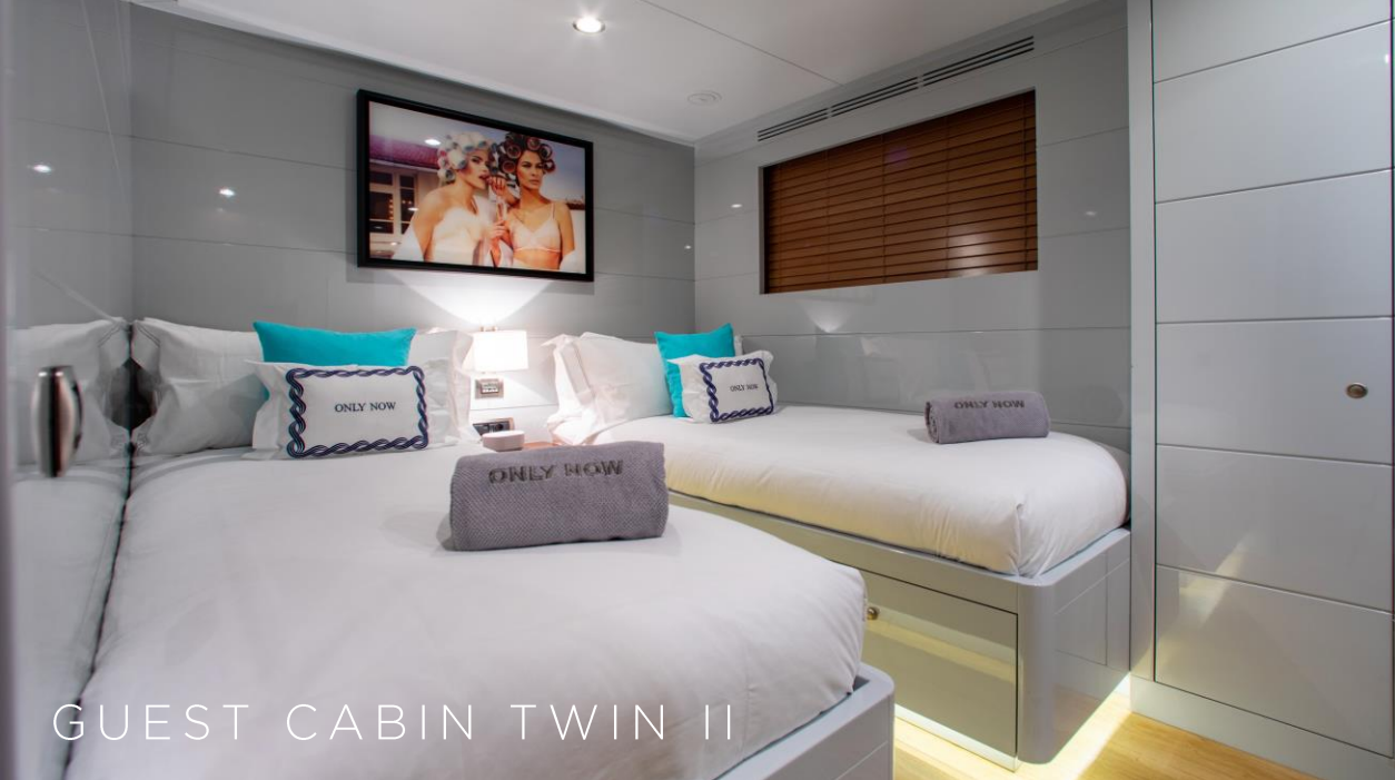
GUEST CABIN TWIN II