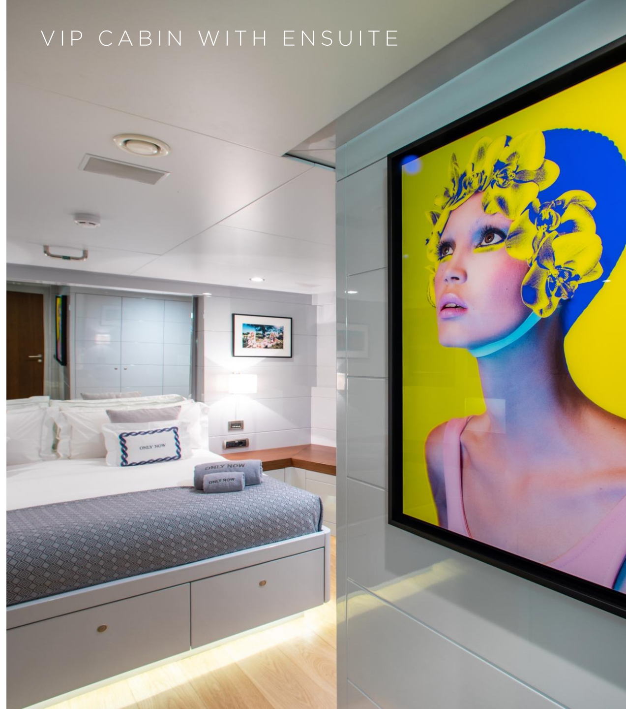
VIP CABIN WITH ENSUITE